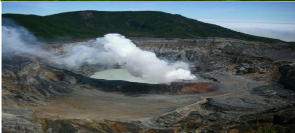
A stunning view of the active Paos Volcano, just a short drive

The Barceló San Jose Palacia boasts the largest, most prestigious conference center in Costa Rica. With wireless connections throughout the hotel, the Barceló San Jose Palacia provides modern solutions to increase productivity during your meetings and conventions. With our group ASHRAE rate, the expected cost of rooms will range from $105-$150/night. The hotel is fully equipped and the concierge is more than helpful to assist in arranging transportation, tours and recommend restaurants. The airport is about a 20-30 minute ride away.