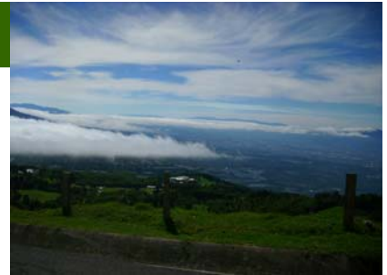
Mountainside in San Jose, Costa Rica headed to Paos Volcano

The Florida West Coast Chapter is very pleased to announce that we will be hosting the 2011 August Chapters Regional Conference at our Section in San Jose Costa Rica. The hotel will be in the capital of Costa Rica, but there will be opportunity to travel and experience the 12 microclimates. The country is about 200 miles wide so there is opportunity to go coast to coast, visit a volcano or extend into the clouds at 12,000 ft.